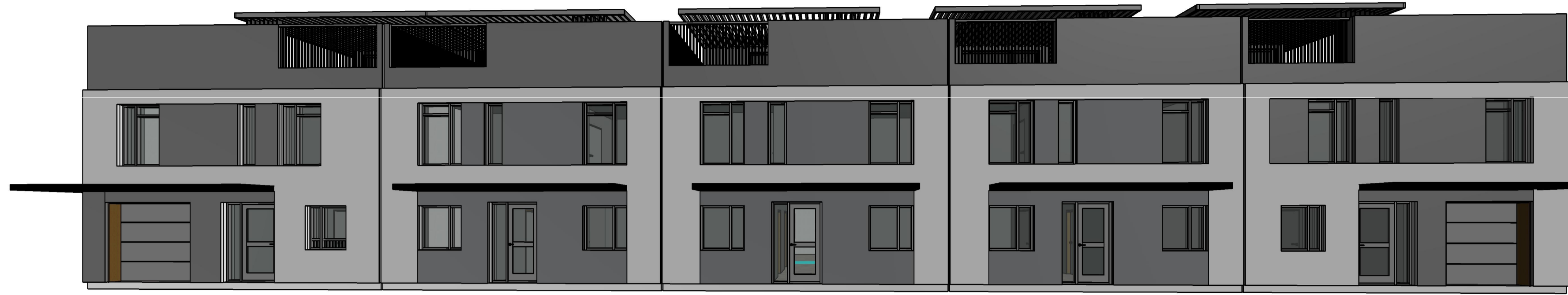
3D Framhlið mkv: