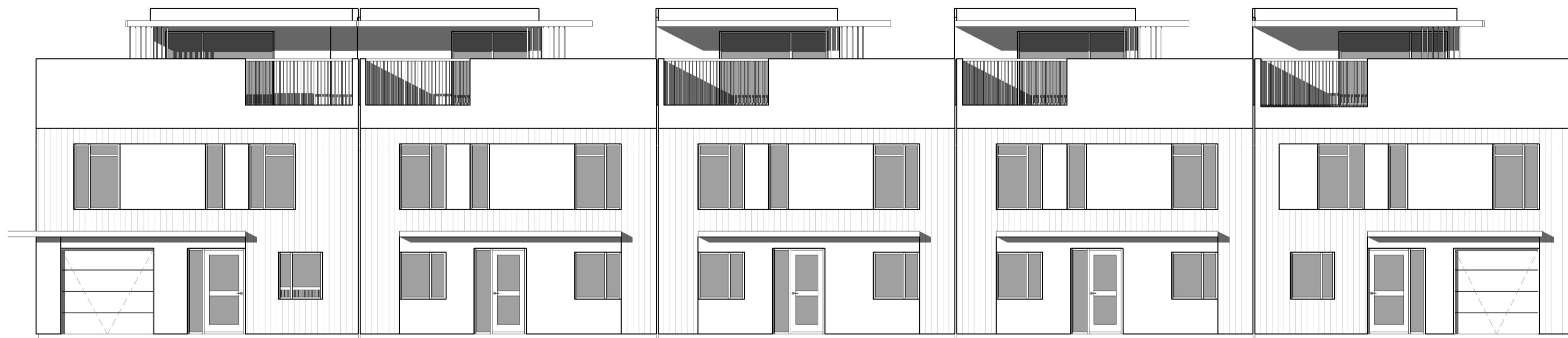
Suður mkv: 1 : 100