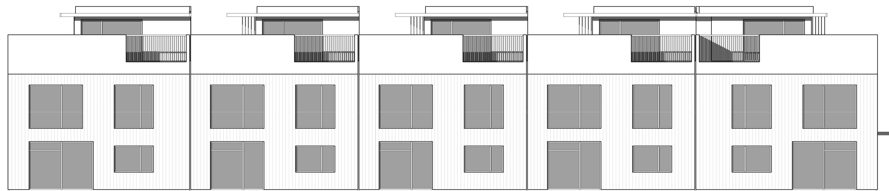
Norður mkv: 1 : 100