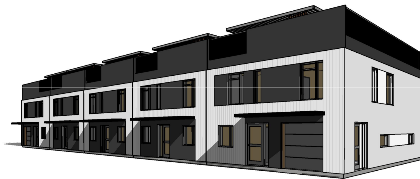
3D View 7 mkv: