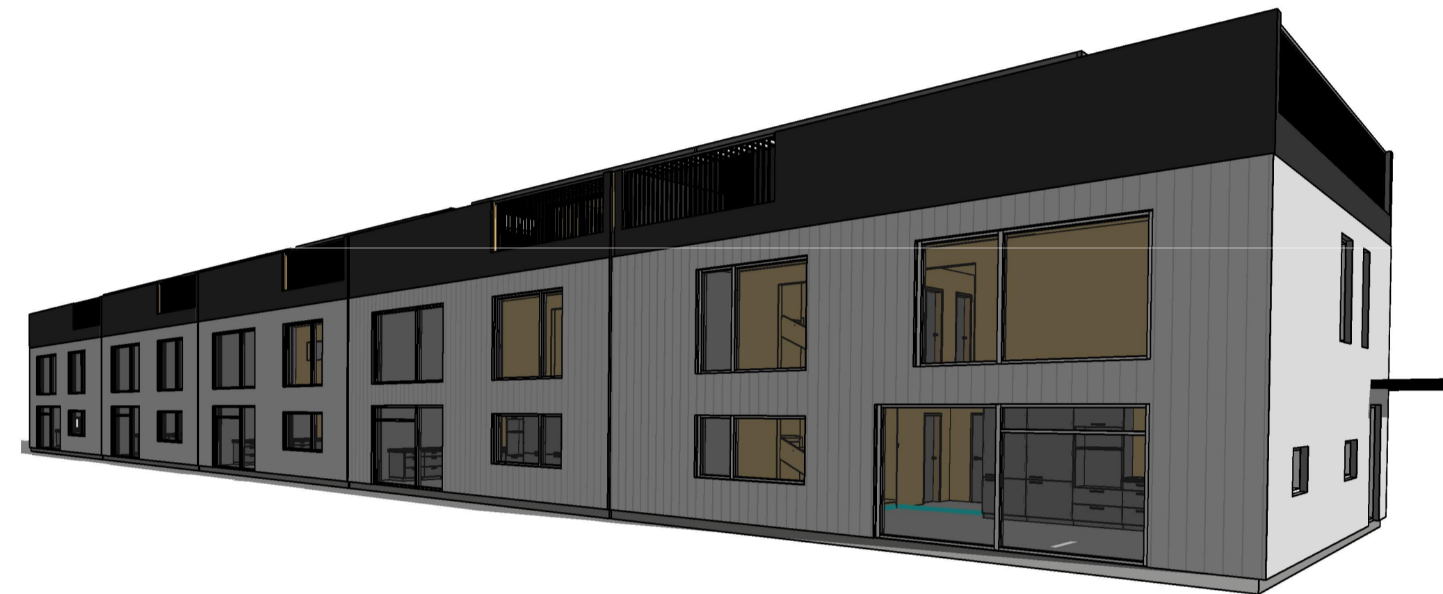
3D View 8 mkv: